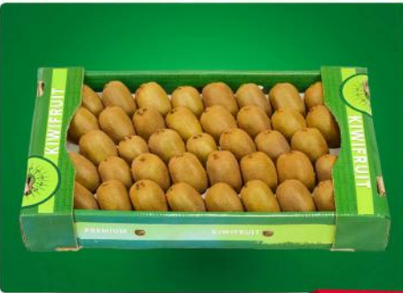
SINGLE-ROW CARTON OF 39 PIECES kiwi