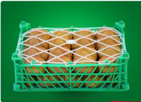
2 KG CARTON OF KIWI kiwi