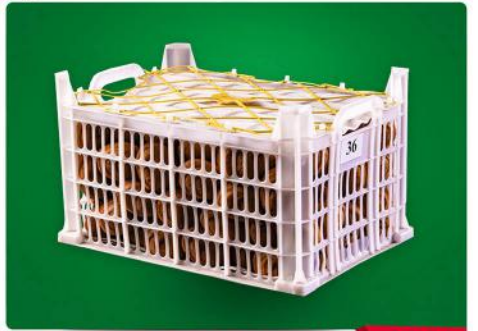
10 KG BASKET OF KIWI kiwi