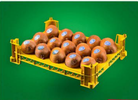
SINGLE-ROW BASKET OF 15 PIECES kiwi