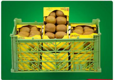
8 KG BASKET FOR 1 KG CARTON kiwi