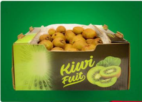
10 KG CARTON OF KIWI kiwi