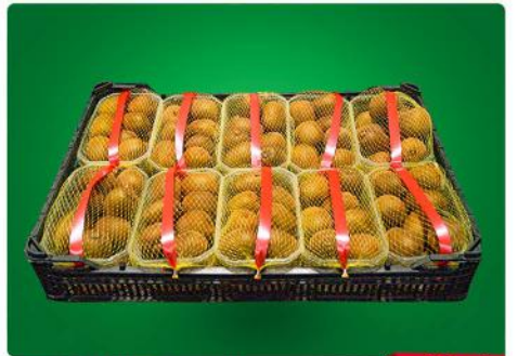
1 KG BASKET OF KIWI kiwi

The sorting and packaging center of Kiwi is located 20 km from Astara. With 3 cold storages of 5000 tons in Astara and Choubar, we can store kiwi in the highest possible quality for up to 9 months. Our company is equipped with the most advanced kiwi sorting machines in Iran.