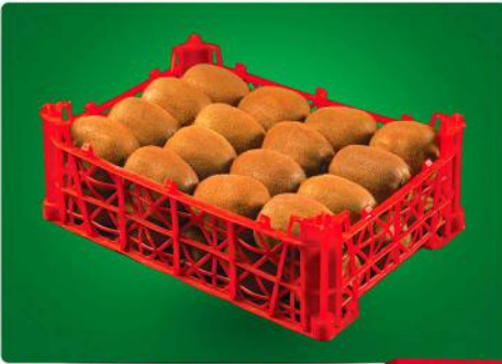
PACKING BASKET 4 KG kiwi